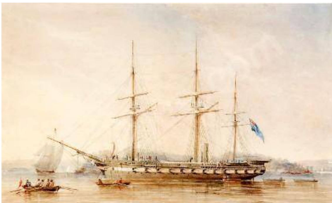
HMS Vulcan at Garden Island Sydney, watercolour by Frederic Garling

The British Society of Australian Philately Founded 1933